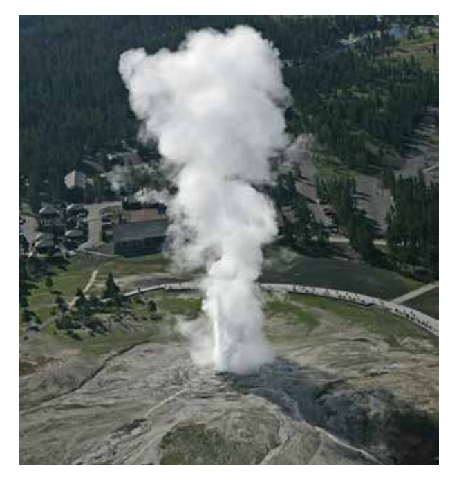
A raven's perspective on Old Faithful Geyser.