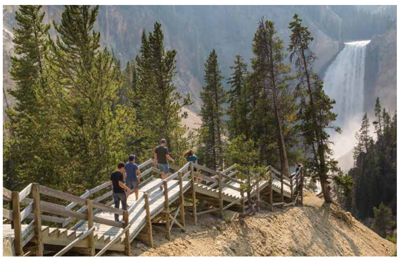
Stunning views of the Grand Canyon of the Yellowstone River, and the Upper and Lower Falls, are abundant at overlooks and along the rim trails.

This project will provide future visitors with an opportunity to experience the wonders of the Grand Canyon of the Yellowstone River safely, and enjoy the full grandeur of its incredible vistas.