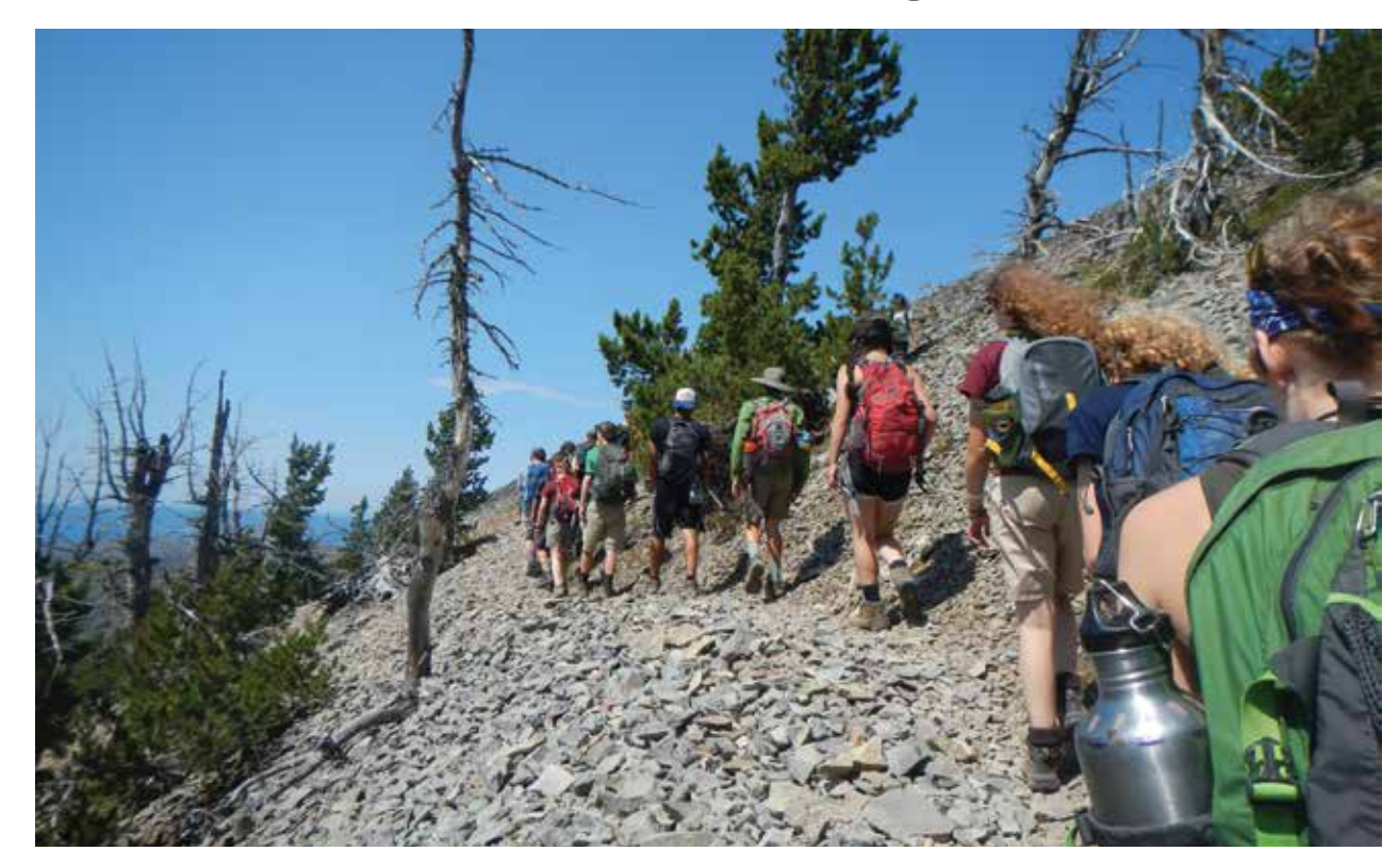
Youth Conservation Corps participants will be one of the groups supported by a new youth campus.